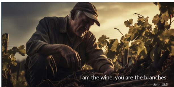
I am the vine, you are the branches.

'I am the true vine, and my Father is the vinedresser. Every branch in me that bears no fruit he cuts away, and every branch that does bear fruit he prunes to make it bear even more. You are pruned already, by means of the word that I have spoken to you. Make your home in me, as I make mine in you. As a branch cannot bear fruit all by itself, but must remain part of the vine, neither can you unless you remain in me. I am the vine, you are the branches. Whoever remains in me, with me in him, bears fruit in plenty; for cut off from me you can do nothing. Anyone who does not remain in me is like a branch that has been thrown away – he withers; these branches are collected and thrown on the fire, and they are burnt. If you remain in me and my words remain in you, you may ask what you Will and you shall get it. It is to the glory of my Father that you should bear much fruit, and then you will be my disciples.'