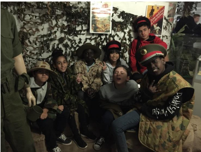
Queenscliff fort – dress as a Soldier