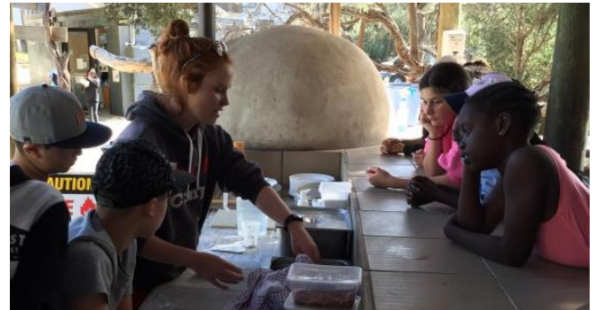
Make your own Pizza